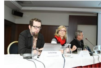
Lecture of significant spaniard architect Carlos Arroyo