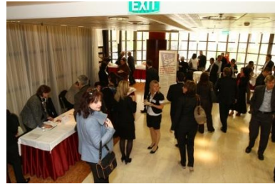
Debate of participants during snack break