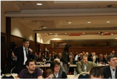
Debate with lecturer