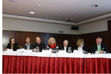
Panel debate at the end of the conference