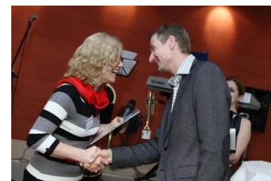
Winner of VISIO 2020 award

Preview of last year Eurostav conference Sustainability in architecture and construction