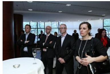
VISIO 2020 - Eurostav magazine award - event