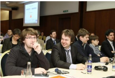
Participants of conference