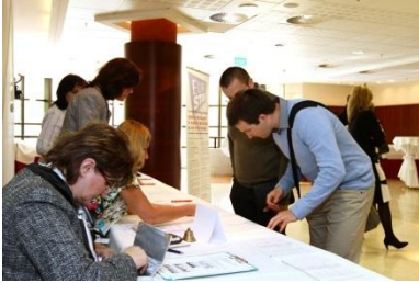
Registration of participants